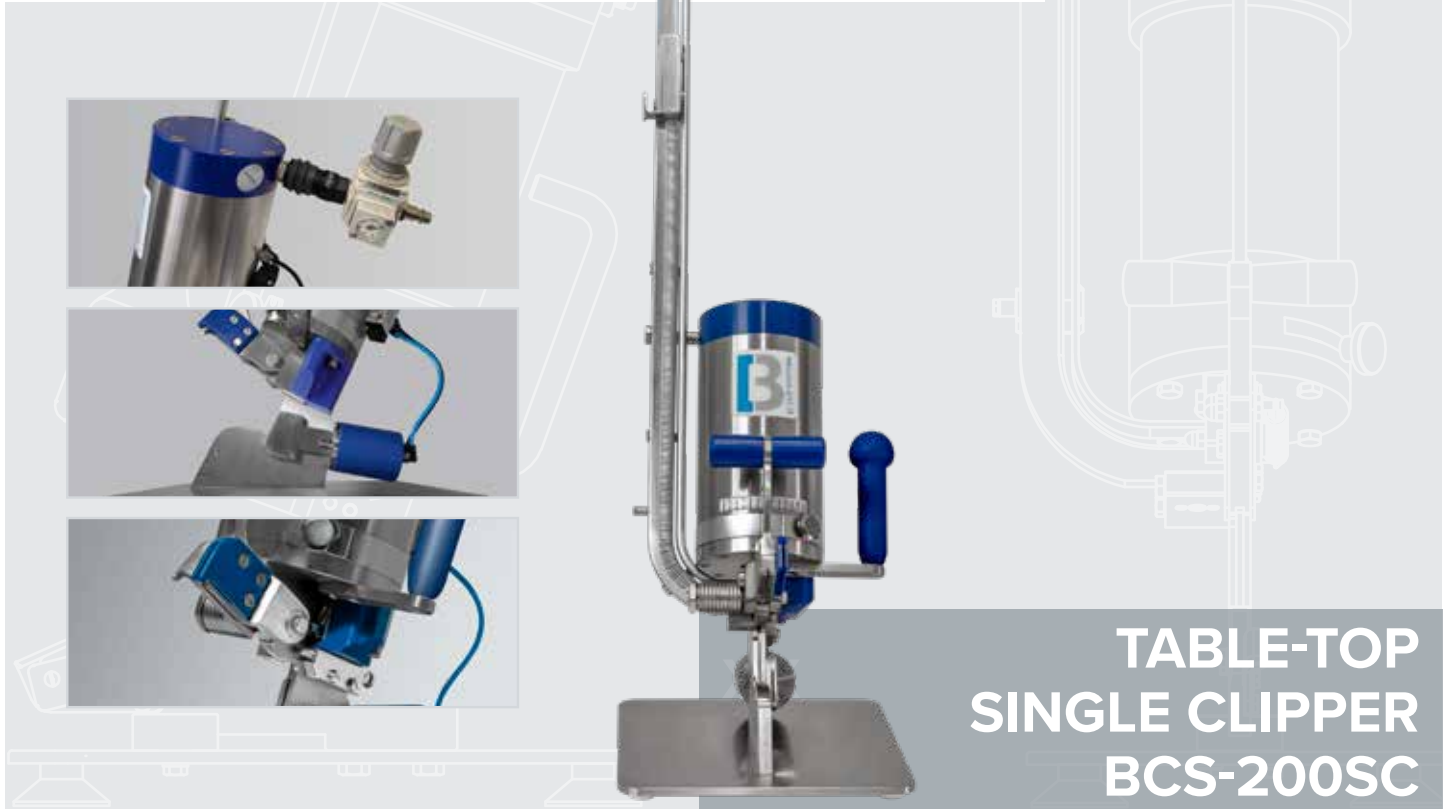
TABLE-TOP SINGLE CLIPPER BCS-200SC